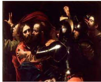
Caravaggio, The Taking of Christ (1602)

Gospel: The contrast between light and darkness / good and evil is beautifully evoked. God has entered the human drama with his Son so that all those who believe in him may have eternal life.