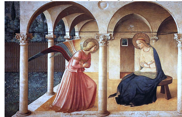
The Annunciation of the Angel Gabriel to Mary by Fra Angelico (Florence, c.1450)

BonMot: God gave himself to you; give yourself to God.